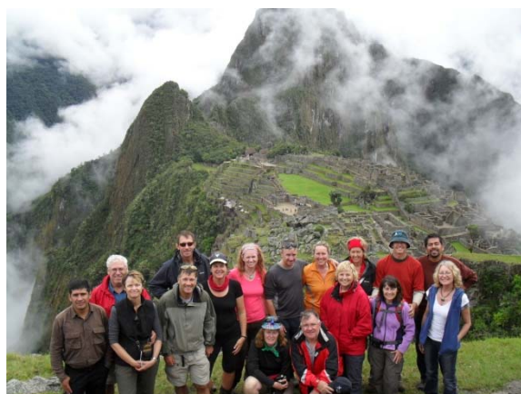
Group photo at Machu Picchu -April 28, 2010

In April this year, 15 of us travelled to South America for a taste of Peru. Since I first saw a picture of Machu Picchu some 30 years ago, I'd always dreamed of one day being there; overlooking those ancient ruins with the backdrop of Wayna Pichu ('Young Mountain') guarding the Incan citadel, shrouded in mist.